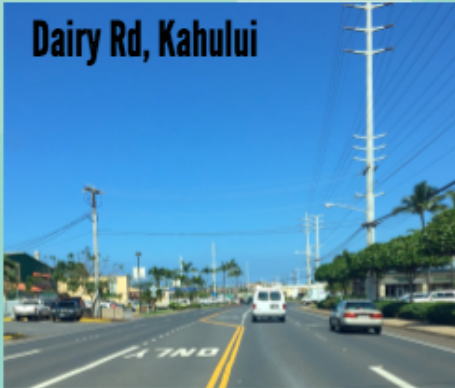
Dairy Rd, Kahului